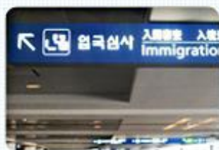
Proceed to the Immigration booth (2 nd floor)