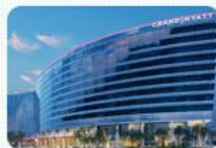
Arrive at the hotel 15~20 minutes

※ If you need more information about the hotel service, you can speak with an agent at the STPC/SKYPASS Counter (1F) (Passengers arriving at Incheon airport between 22:00~04:45, please proceed directly to STPC/SKYPASS Counter,