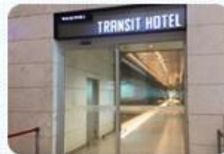
Arrive at Transit Hotel or Lounge