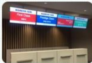
Proceed to Korean Air Transfer Desk