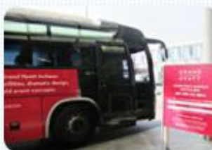
Take Hyatt's free shuttle (Exit No.2A 1 st floor)